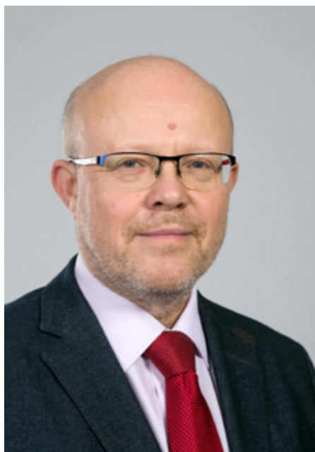
Vlastimil Válek Minister of Health