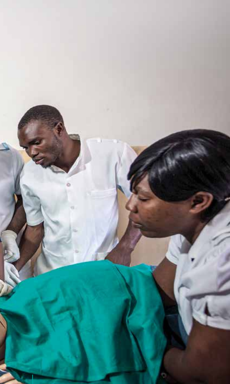
ICAP. The Global Nurse Capacity building Program works to strengthen the quantity and quality of the nursing and midwifery workforce in sub-Saharan Africa.

ICN strongly encourages health systems and countries around the world to place a high value on the education of their nursing staff. Investment in nursing education will further drive the health system to deliver care that individuals and communities need by i) improving knowledge and competence; ii) increasing confidence in clinical and leadership skills, critical thinking and decision making; and iii) increasing job satisfaction and retention. Such investment will be a great catalyst for positive transformation.