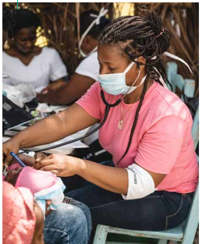
Earthquake Response – Haiti.

A referendum was held in Switzerland in 2021 to address the country’s nurses’ working conditions. As a result of a positive vote, nurses will be supported with better pay, education and working conditions. This public show of support recognises the valuable contribution of nurses and demonstrates its commitment to putting their support into action.