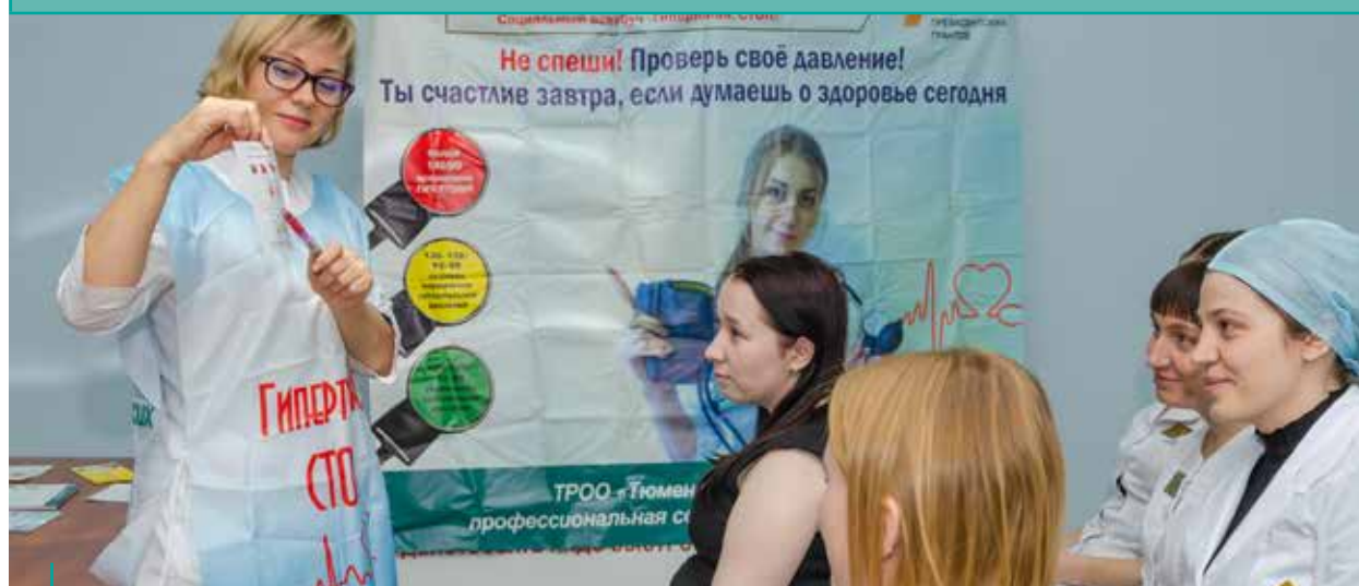
Tyumen Regional Nurses Association, Russia.