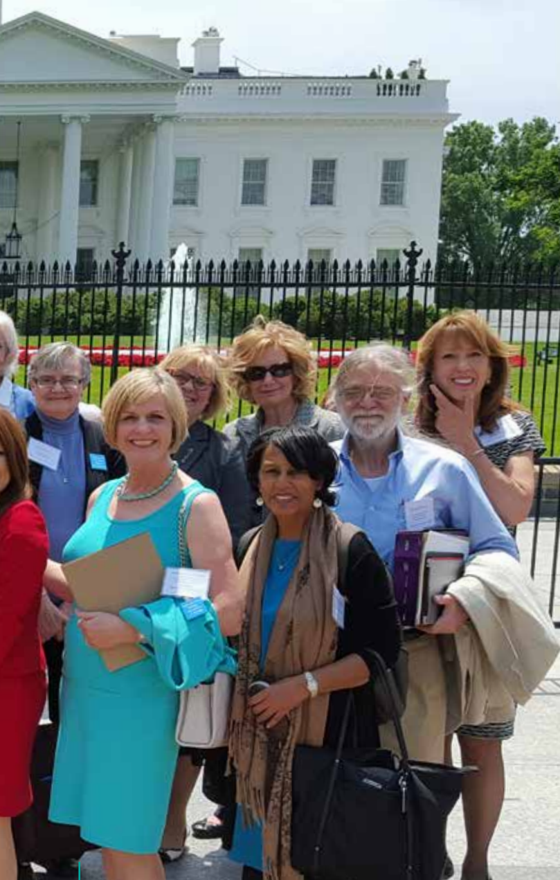
Alliance of Nurses for Health Environments. Nurses meet with the Obama Administration in 2016 to address nursing's contribution to mitigating the effects of climate change.