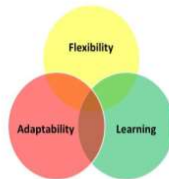
Figure 1. The three factors for resilience

In an article that draws from insights of research into resilience from other fields, Kruk et al (2015) explore health system resilience. They describe resilience as an emergent property of the health system as a whole, which cannot necessarily be addressed by considering the national context alone. They consider health system resilience to be a global public good which needs a collective response from the global community.